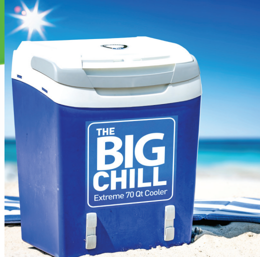
Typical applications: Stadium seats, coolers, OEM tools, powder-coated metal, low VOC paints, OEM equipment, smooth LSE surfaces, composite plastic

TenaciousTac <sup>™</sup> uses 5 and 7-year weatherable outdoor vinyl label stock that works great on tough-for-anything-to-stick-to surfaces, including highly textured surfaces, low surface energy plastics, low VOC paint, powder-coated metals, MDF and much more.