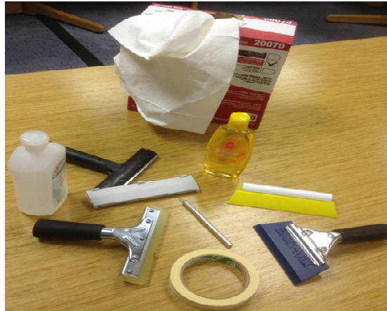
Figure 1: Cleaning and Installation Tools for MACtac SAG films