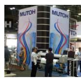
Trade Show Displays