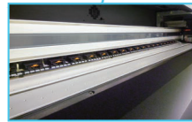
High Precision Aluminum Rail Mechanism