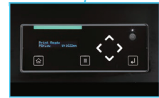
LED touch panel